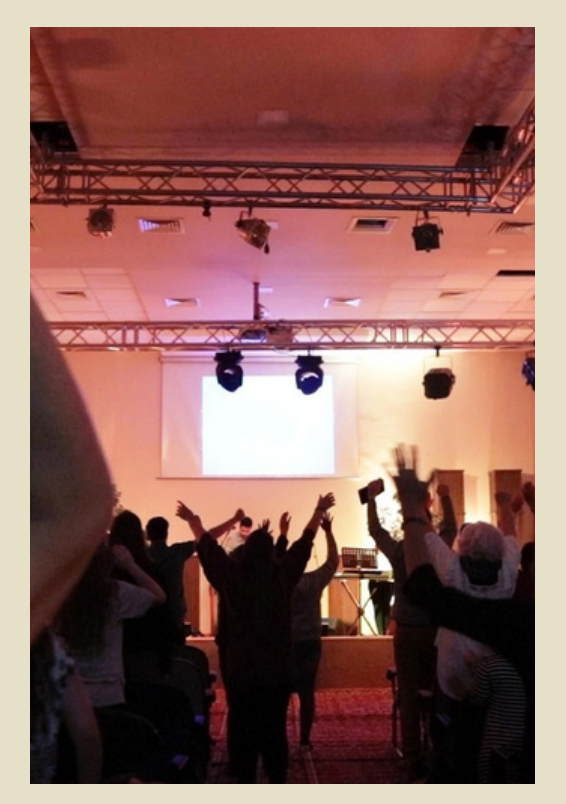
A 10/40 WINDOW PRAYER MEETING